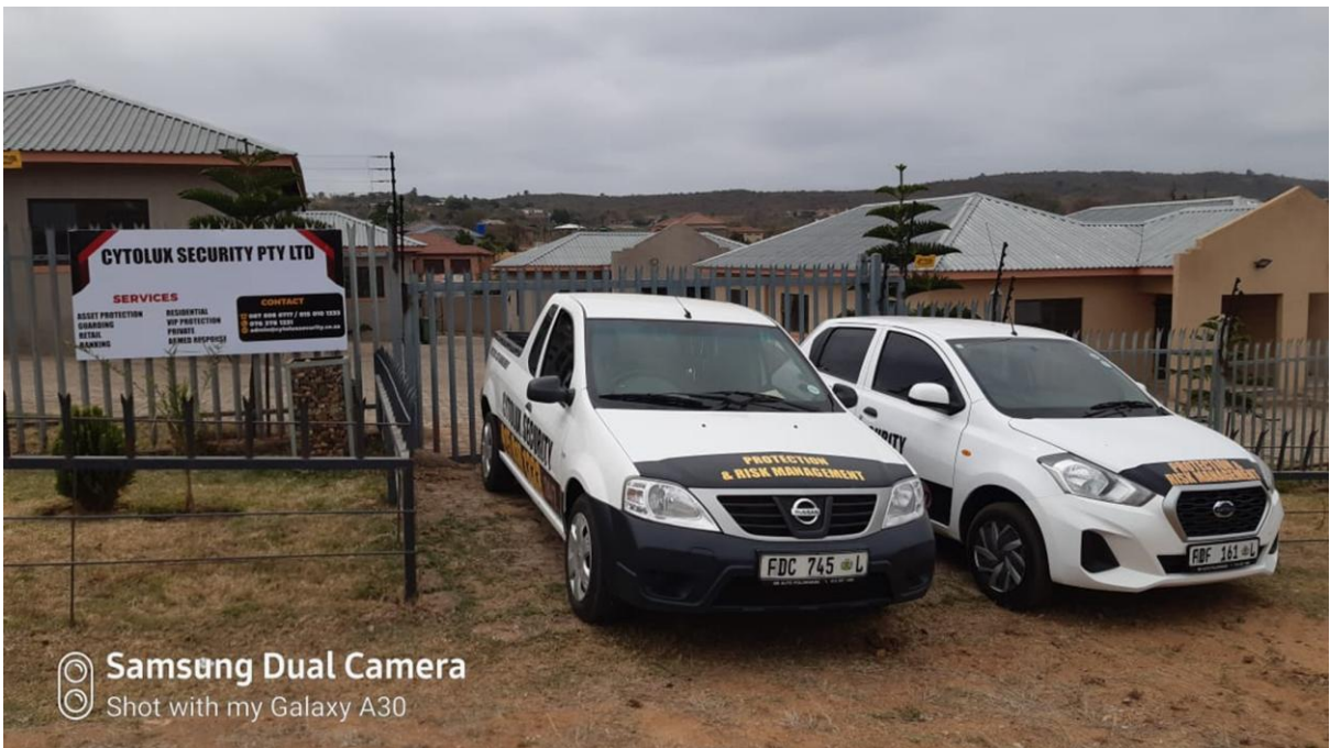
Samsung Dual Camera Shot with my Galaxy A30